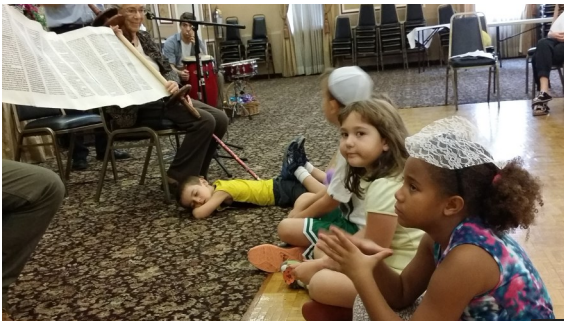
BARRIER-FREE SERVICE EMJC