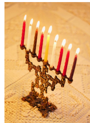
FIRST CHANUKAH CANDLE DECEMBER 16