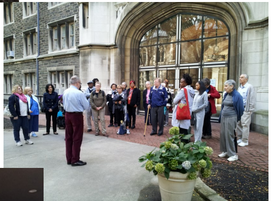
INTERFAITH WALK IN MORNINGSIDE HEIGHTS OCTOBER 13