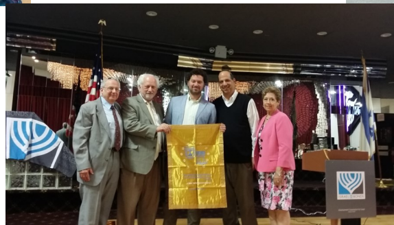
ISRAEL BOND BREAKFAST